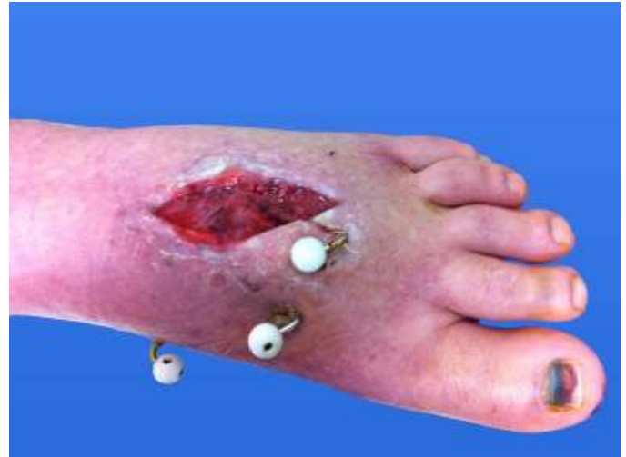
Figure 4 Left foot with dorsal wound and percutaneous Kirschner wires.

The patient was taken to the operating room for decompression fasciotomy of the left foot. The laceration on the dorsal aspect of the patient's foot was extended proximally and distally. Upon decompression of the interosseous compartment, there was approximately forty to fifty cubic centimeters of hematoma released from the wound. After evacuating this hematoma, the dorsal aspect of the left foot was soft upon palpation and there was hyperemic response to digits 3-5. The remaining compartments were soft and were not released. The wound was then subsequently irrigated with 6 liters of normal saline. A negative pressure therapy device was then applied to the patient's left foot (Wound Vac KCI™, San Antonio).