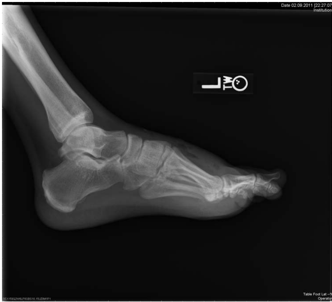
Figure 1 lateral view showing subcutaneous air dorsally.