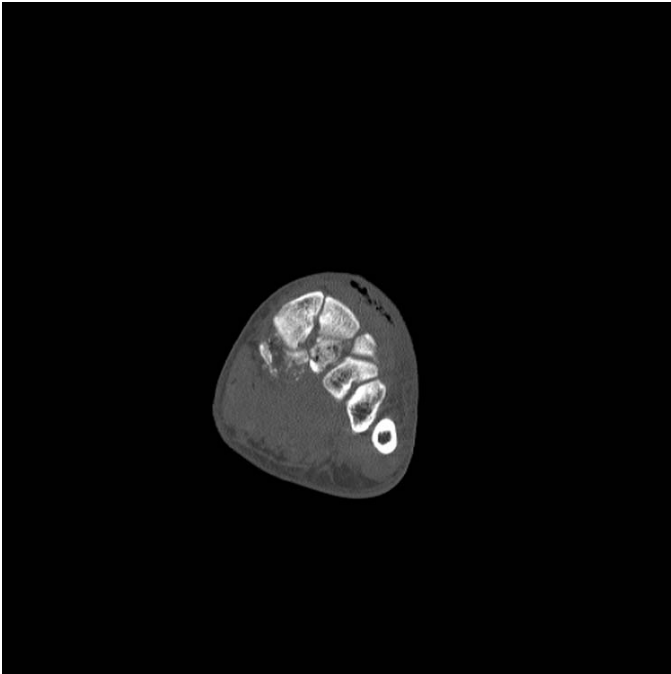
Figure 3 Frontal view also shows the Lisfranc injury with subcutaneous air.

There were intra-articular fractures of third and fourth metatarsal bases noted without displacement. There was diffuse soft tissue swelling with numerous scattered subcutaneous and intramuscular air bubbles. (Figs. 1, 2 and 3)