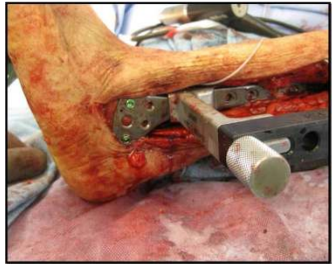
Figure 3 Application of the distal femoral locking plate to stabilize the Charcot ankle is technically simple.

A linear incision was made adjacent to the course of the fibula. An oblique osteotomy was made at the distal third of the fibula. The fibula was resected and removed from the operative table. The tibiotalar joint was then resected with the sagittal saw. (Figs. 2A and 2B) An ankle arthrotomy was performed medially and the medial malleolar articular surface was resected with a sagittal saw forming a miter at the medial aspect of the tibial surface. (Fig. 3) The subtalar joint was denuded of cartilage using a curette.