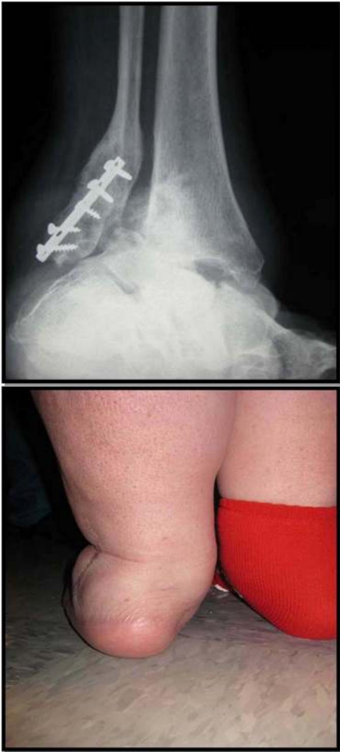
Figure 1A and 1B Pre-operative radiograph (A) and patient (B) with combined Charcot ankle valgus and subtalar deformities.

According to Pelton and Carvaggi, intramedullary nails are a good method for TTC arthrodesis with 88% and 92.8% fusion rates respectively. 2,7