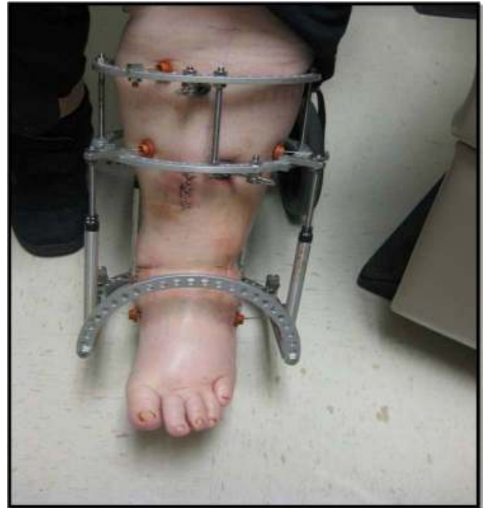
Figure 5 Clinical presentation during 3-month course in external fixators.

Three patients (75%) had satisfactory outcomes with only minor complications. Two patients (50%) required blood transfusion following surgery, and one (25%) had mild pin tract infections which responded quickly to oral antibiotics. One patient (25%) had failure of the procedure with development of osteomyelitis and ultimately had a below knee amputation. This patient did not have an active infection at the time of surgery however; this patient had a history of prior osteomyelitis from previous procedures and was in renal failure. These pre-operative factors ultimately could have contributed to the patients post-operative wound dehiscence and ultimate recurrence of osteomyelitis. On average, osseous consolidation was appreciated in 77 days for those patients that had successful outcomes. (Fig. 5) The patients with successful outcomes were able to ambulate pain free in a CROW boot. Table 1 summarizes the four patient outcomes.