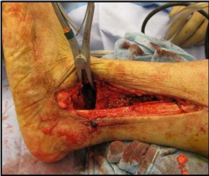
Figures 2A and 2B Surgical resection of the fibula (A) is performed prior to resection of the tibiotalar joint. (B)