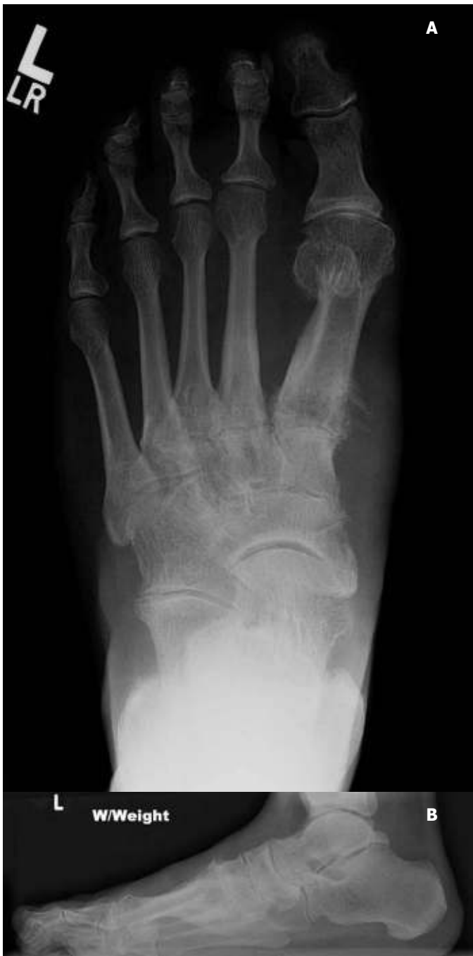
Figure 1A and 1B Initial anterior posterior (AP) (A) and lateral (B) radiographs demonstrating soft tissue edema with early signs of osteolysis, cortical thickening, fragmentation, and osseous destruction within the tarsometatarsal and naviculocuneiform joints.

Total contact casts (TCC) have been shown in numerous studies to be an effective immobilization device in the treatment of acute Charcot neuroarthropathy. 5,7-14,16-20