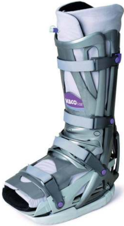
Figure 2 In this boot, by removing air from a vacuum cushion, small beads contour around the lower limb and create vacuum stabilization.

Two of the three patients reported a minor injury preceding the Charcot event. The third patient had had previous amputations of digits two and three for localized osteomyelitis secondary to contiguous digital ulcerations. All three patients were male with a mean age of 48.7 (range 46-53) years. All patients presented within two weeks of first symptoms and were ulcer free at the time of initial presentation with this being their first occurrence of Charcot neuroarthropathy. Radiographs were obtained with findings consistent with early signs of Charcot neuroarthropathy. (Fig. 1A and 1B) Magnetic resonance (MR) imaging further confirmed the diagnosis with diffuse bone marrow edema adjacent to the Lisfranc joint.