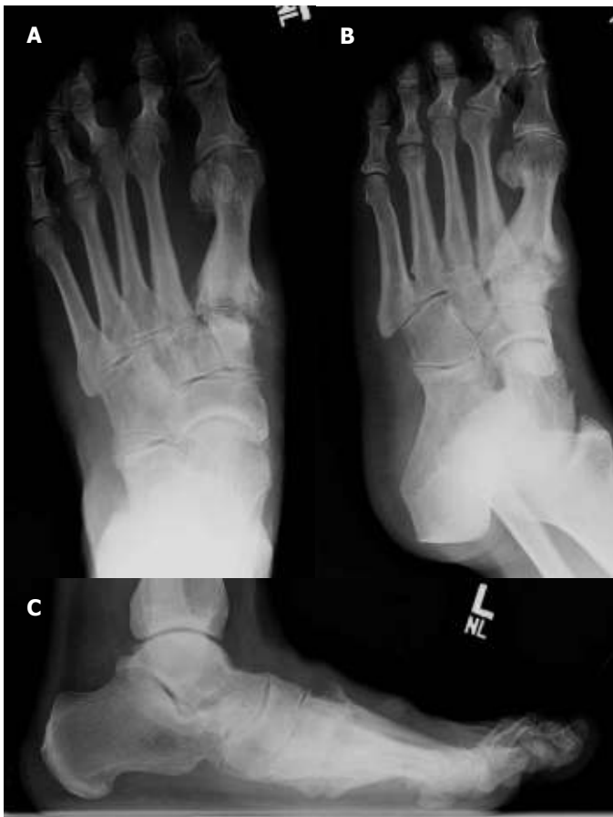
Figure 3A, 3B and 3C Progression of acute phase of Charcot neuroarthropathy. AP (A), Oblique (B) and lateral (C) views demonstrate increased osseous destruction and osteolysis.

However, the third patient did not obtain prescribed accommodative shoes or inserts citing financial limitations. He was subsequently lost to follow-up for five months after completing 12 weeks of immobilization therapy. His Charcot neuroarthropathy had developed a rocker bottom foot deformity and plantar midfoot ulcer after five months of interrupting care.