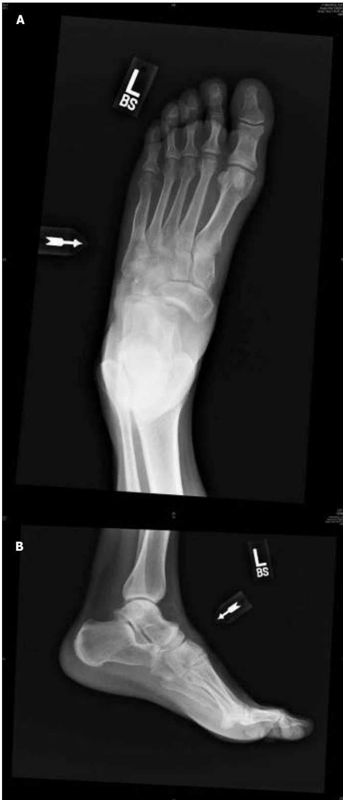
Figure 1A and 1B Anteroposterior (A) and Lateral (B) view of the original injury.