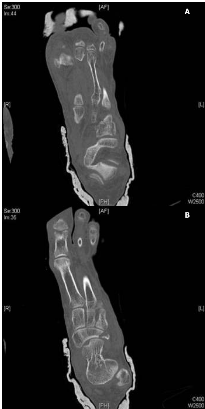
Figure 3A and 3B Axial computed tomography (CT) showing the cuboid fracture. (A) Axial CT showing the navicular fracture and the talar head impaction fracture. Post initial closed reduction. (B)

He reports no pain or disability to the joint complex with ambulation at the latest follow-up. At his latest scheduled appointment, five months after the initial injury, the patient did not return for follow-up and was not able to be contacted for further evaluation. No evidence of avascular necrosis or delayed healing has been appreciated to date.