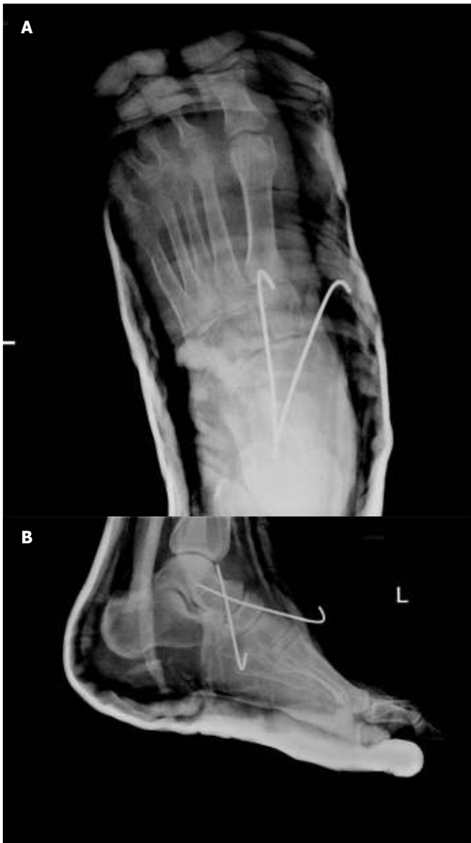
Figure 4A and 4B Anteroposterior (A) and Lateral (B) view after percutaneous pinning using K-wires.

One was fair and one was poor, owing to the extent of the injury. They recommend that low energy, medial dislocations are most amenable to closed reduction with a poorer prognosis with either open dislocations or lateral dislocations. 4 Van Dorp, et al., had a small cohort of seven patients with varying degree of Chopart's injury. AOFAS scores averaged 72 in their group and 4/7 were pain free after a minimum of six-months of follow-up. 9