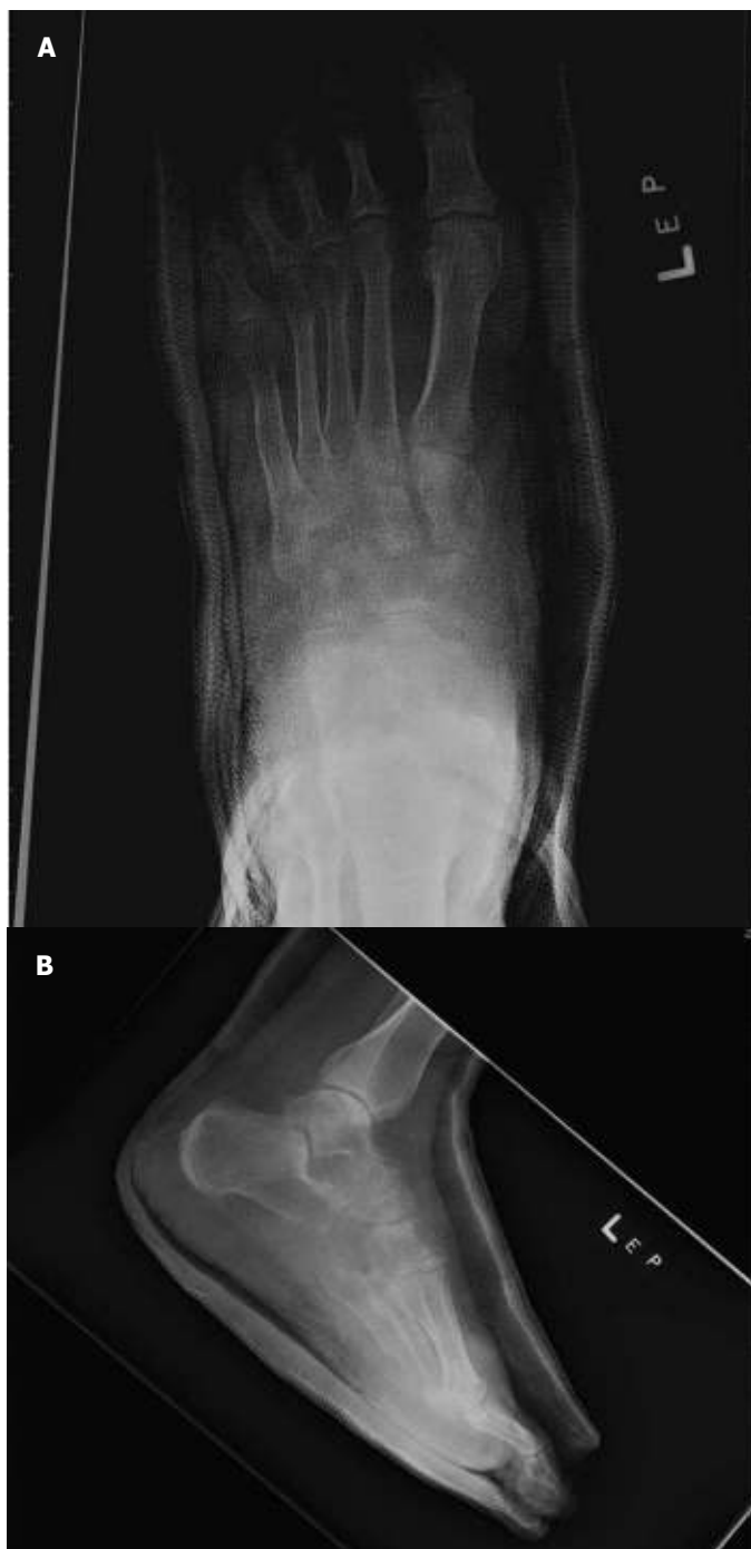
Figure 5A and 5B Anteroposterior (A) and lateral (B) radiographic view after K-wire removal.

Further considerations in treatment are timing of injury to presentation, neurovascular deficit, integrity of the soft tissue envelope and proper imaging. 8