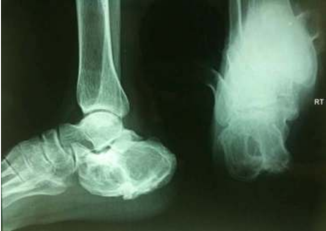
Figure 1 Pre-operative radiographs, antero posterior and lateral views showing eccentric expansile lytic lesion with thin shell of cortex and trabeculae traversing the cyst.

A plethora of cystic lesions can occur in the calcaneum, which makes definitive diagnosis difficult based on imaging only. The differential diagnosis includes simple bone cyst, ABC (primary or secondary), chondroblastoma, giant cell tumor (GCT), osteosarcoma, ossifying hematoma or pseudotumor of hemophilia. This mandates histopathological diagnosis prior to the definitive management.