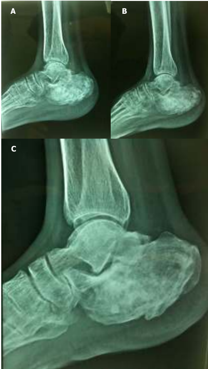
Figure 3: Follow-up radiographs showing incorporation of graft material at 1 month (A), 6 months (B), and at 2 years follow-up (C) showing consolidation of graft and no recurrence.

Other modalities such as wide excision or arterial embolisation may be considered. Although relatively rare, there is no reason to assume that ABCs of the feet will respond to treatment or recur any differently from ABCs that occur elsewhere in the body. Surgical curettage is sufficient to treat most ABCs of the feet, including the calcaneum. 14