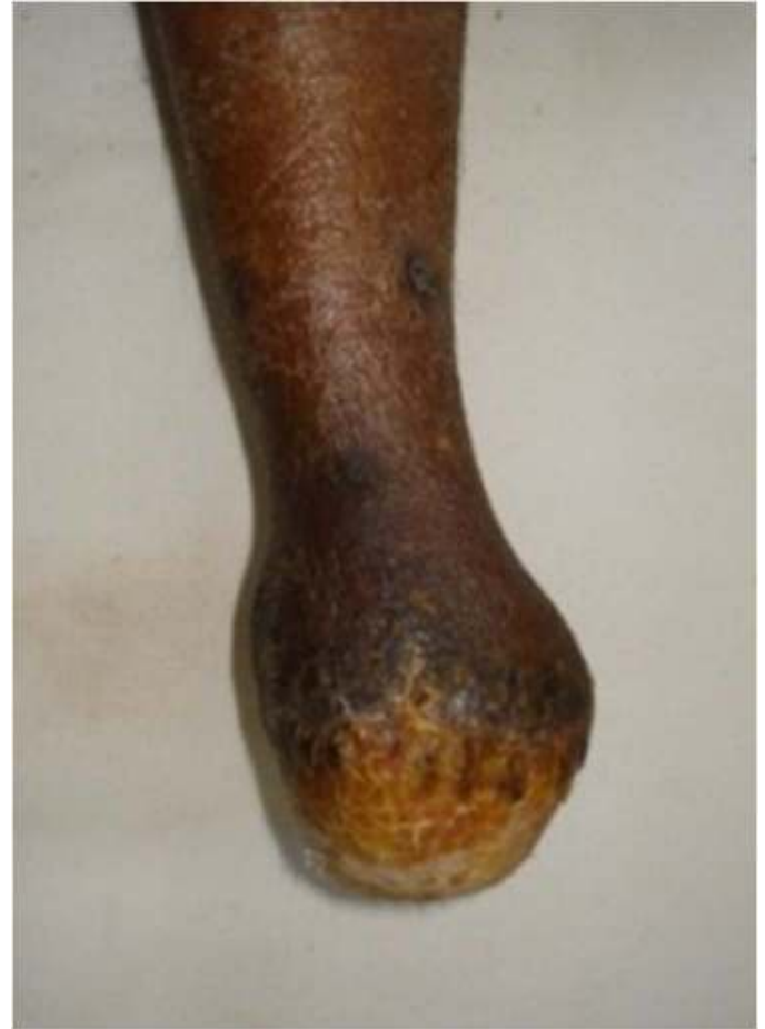
Figure 6 Boyd's amputation 6 months after surgery showing functional stump.

Actinomycetoma is amenable to treatment by antibiotics, preferably by combined drug therapy for long periods. Eumycetoma is usually treated by aggressive surgical excision combined with medical treatment. 11 Without proper treatment, mycetoma can lead to deformity, amputation, and death. 12