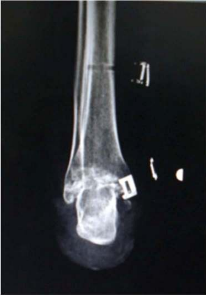
Figure 5 Boyd's amputation 6 months after surgery showing functional os calcis.

Treatment was medical for actinomycetoma and surgical for eumycetoma. Lesions were located on the foot in 81 patients. Sixty six patients with actinomycetoma were cured by medical treatment. Distinction between eumycetoma and actinomycetoma is very important for the treatment. 10