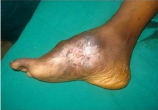
Figure 1 Clinical photograph of Madura foot.

Although the clinical picture is characteristic, diagnostic confusion may occur with chronic bacterial osteomyelitis, especially when bone destruction has occurred. Botryomycosis can give a similar picture. This is a chronic bacterial infection caused by gram positive cocci (Staphylococci, Streptococci) and gram negative bacteria (Escherichia coli, Pseudomonas, Proteus) that can lead to subcutaneous swelling and draining fistulas. Like mycetoma, grains (colonies of bacteria) can be found in suppurative discharges and biopsy specimens. In botryomycosis however, organs can be affected too. Neoplasms (benign and malignant) should be excluded as well.