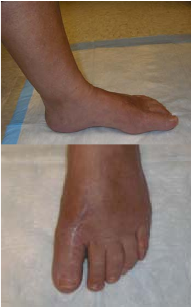
Figures 6 Clinical pictures one year following first metatarsophalangeal fusion with interpositional bone graft with iliac crest allograft.

Fixation can then be obtained using a 1/3 tubular plate or locking plate system, preferable placed on the dorsal surface. Postoperatively, the limb is kept unloaded for eight weeks and then partial weight bearing with cast immobilization until radiographic consolidation is present at both graft interfaces. Figures 5 and 6 demonstrate clinical and radiographic appearance of our patient at one year follow-up. In summary, this clinical tip can be useful for the foot and ankle surgeon specializing in revisional surgery.