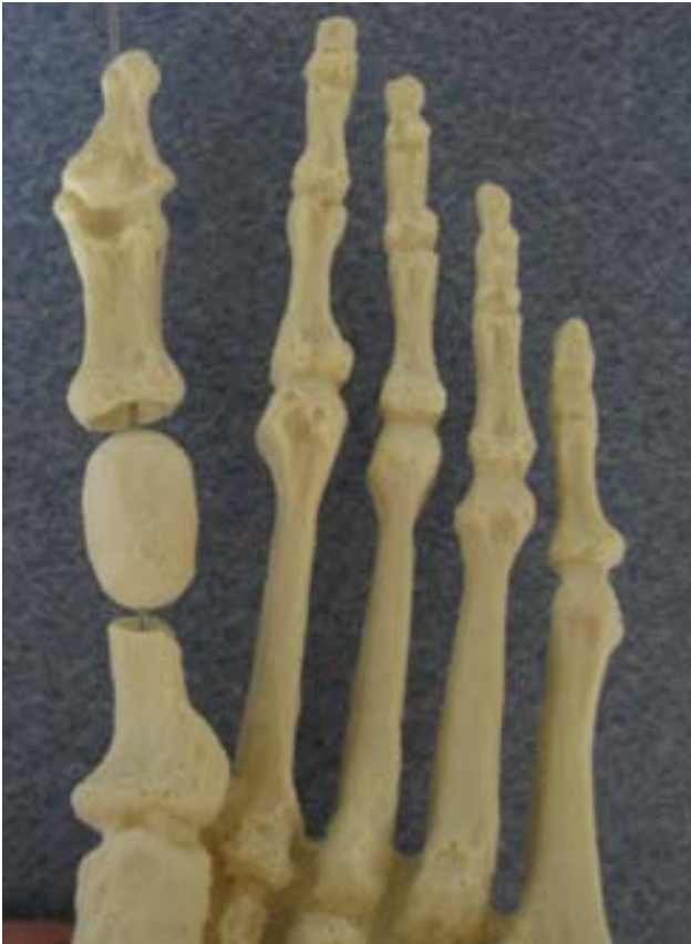
Figure 4 Plantar view of a conically reamed structural bone graft on a corticocancellous saw bone model.

A structural allograft of appropriate length can then be obtained. The case presented in this article utilized cadaveric iliac crest. This graft is then fashioned using cup and cone reamers. The graft can then be inserted and the toe properly aligned in the sagittal, frontal and transverse planes. Figures 3 and 4 show how this graft is properly fit and temporary fixated on a corticocancellous saw bone model.