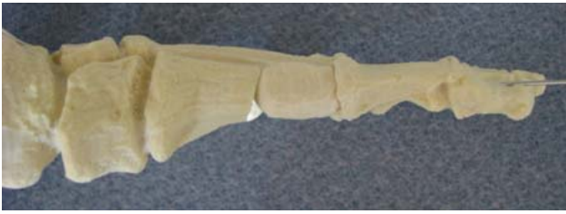
Figure 3 Lateral view of a conically reamed structural bone graft on a corticocancellous saw bone model.