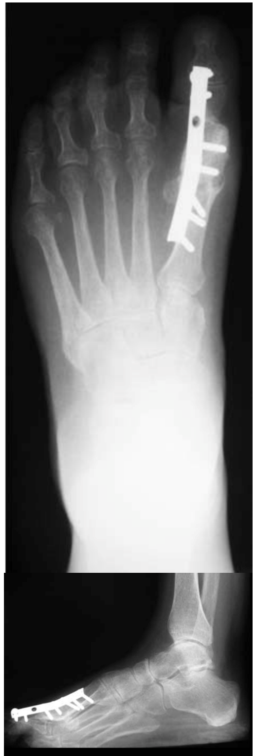
Figures 5 AP and lateral radiographs of a left foot one year following first metatarsophalangeal fusion using iliac crest allograft that was fashioned with a cup and cone configuration.

A structural allograft of appropriate length can then be obtained. The case presented in this article utilized cadaveric iliac crest. This graft is then fashioned using cup and cone reamers. The graft can then be inserted and the toe properly aligned in the sagittal, frontal and transverse planes. Figures 3 and 4 show how this graft is properly fit and temporary fixated on a corticocancellous saw bone model.