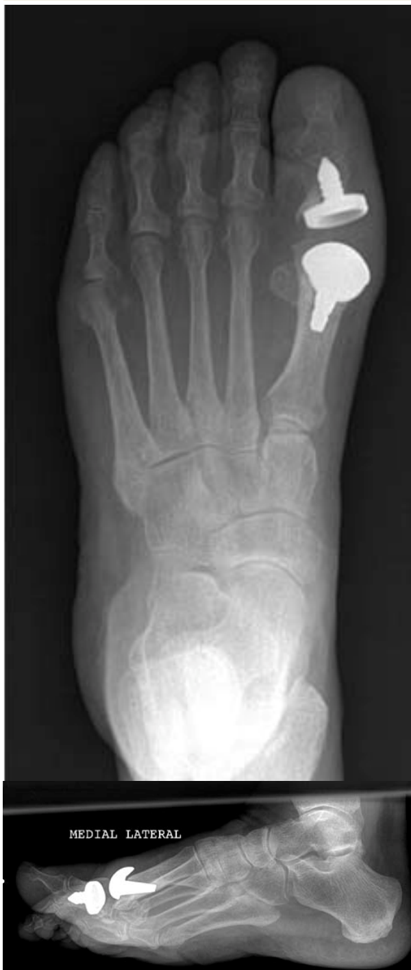
Figures 1 AP and Lateral radiographs of the left foot demonstrating first metatarsophalangeal arthroplasty. The stem of the phalanx prosthesis is partially outside the posterior cortex of the phalanx. The implant was removed to due to pain and instability from the implant.